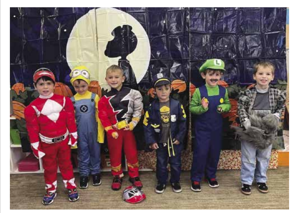
The 4s class from Orange Community Nursery School enjoyed a wonderful fall day a Buttermilk Farm.

In a phone conversation following the election, Moyher expressed gratitude for the Democratic team. "Hope-